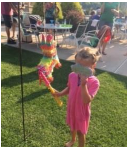
Mexican Fiesta at the pool – Piñata Time!