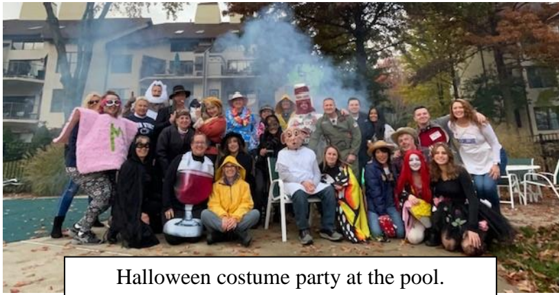
Halloween costume party at the pool.