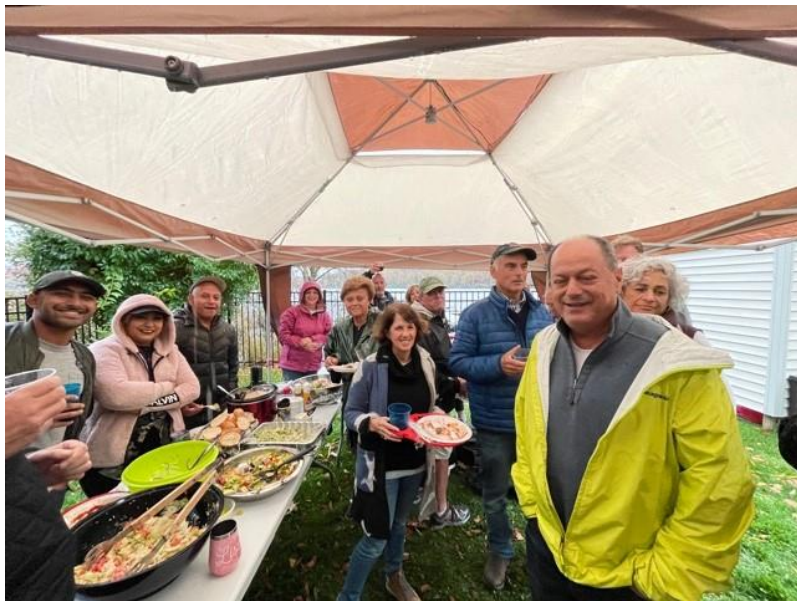
Italian Themed Dinner at the pool – of course, it rained!